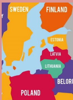
Kaart gemaakt door freepik