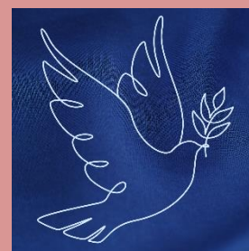
Design: Femke Kleisen