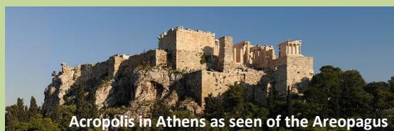
Acropolis in Athens as seen of the Areopagus

CBS Greece will be highlighted in the back of every Workbook next season. This country is also part of CBS' worldwide international work.